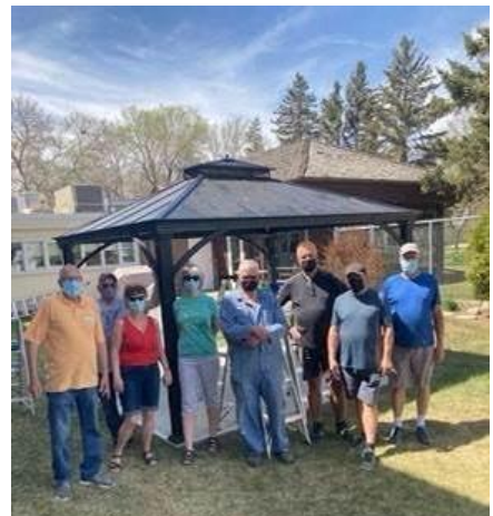
The new gazebo